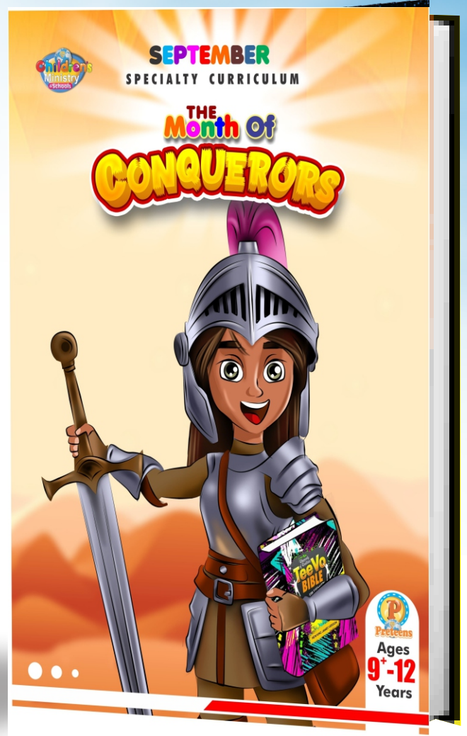
For Preteens (Ages 9+-12)

For More Information and Enquires Please Call: 08123445243 or Email: childrensministry@loveworld360.com Raising Champions...Influencing Tomorrow