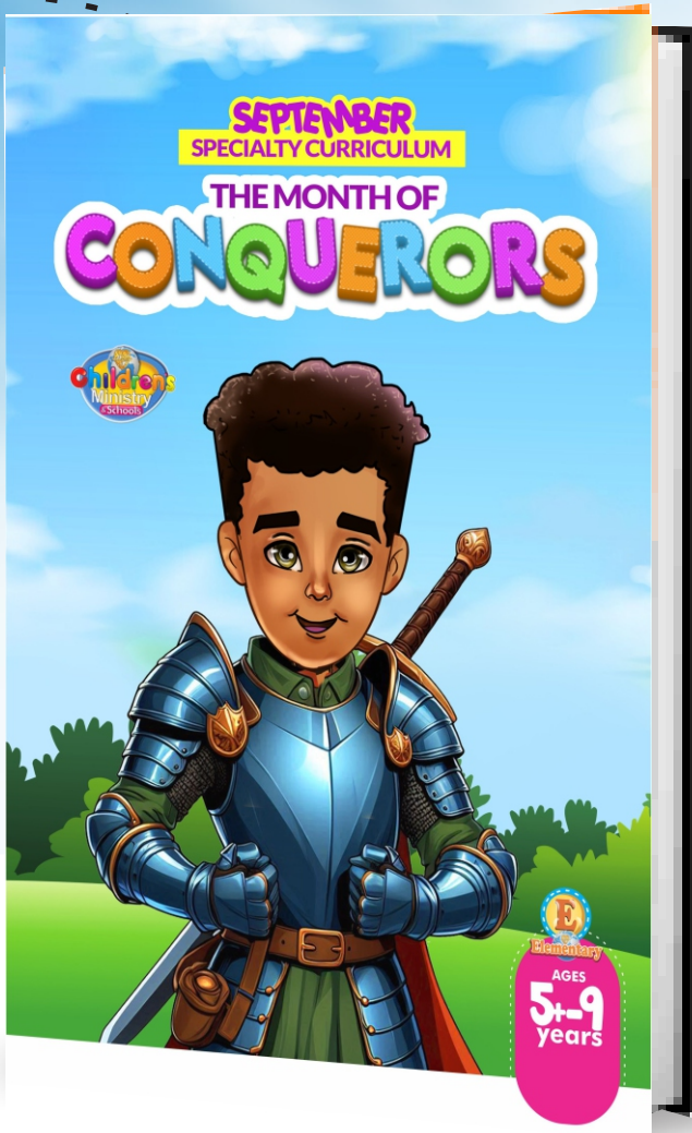
For Elementary (Ages 5+-9)