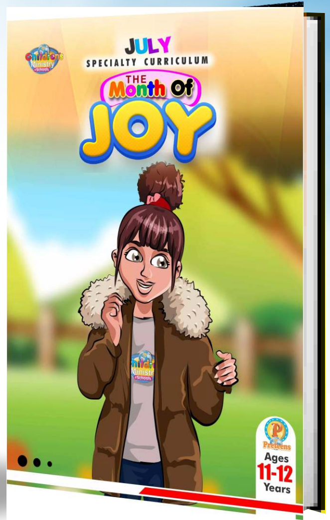
For Preteens (Ages 11-12)

For More Information and Enquires Please Call: 08123445243 or Email: childrensministry@loveworld360.com Raising Champions...Influencing Tomorrow