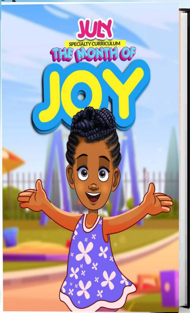
For Elementary (Ages 6-10)