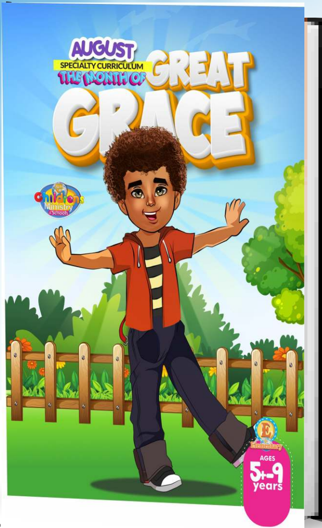
For Elementary (Ages 5+-9)