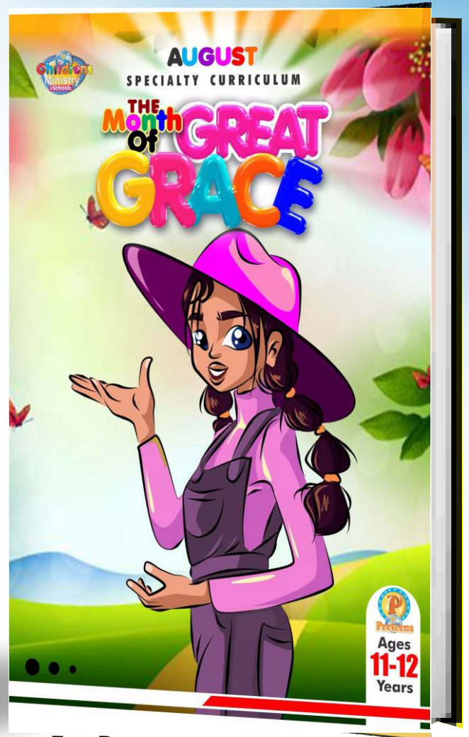
For Preteens (Ages 9+-12)

For More Information and Enquires Please Call: 08123445243 or Email: childrensministry@loveworld360.com Raising Champions...Influencing Tomorrow